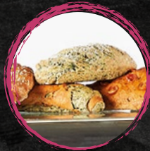
FRESHLY BAKED BREAD