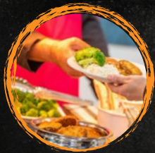
NUTRITIOUS MAIN MEALS