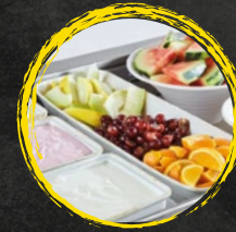
A DELICIOUS DESSERT