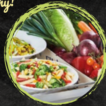
NEW TASTES AND TEXTURES WITH A TRIP TO THE SALAD BAR