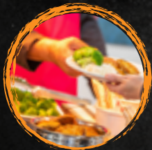
NUTRITIOUS MAIN MEALS