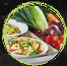
A TRIP TO THE SALAD BAR