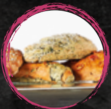
FRESHLY BAKED BREAD