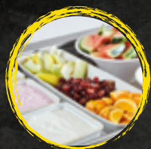
A DELICIOUS DESSERT